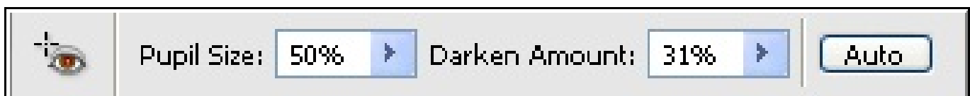
Figure 4 – Red Eye ToolBar

5. Red-Eye Reduction. Since most of us are using small point and shoot digital cameras, the flash is very close to the lens. This leads to Red-Eye for people and animals. The General Fixes - Red Eye Fix in the automated edit will get ride of that pesky problem, lickety split. Or you can use the Red-Eye Removal Tool (fifth tool down). You must first use the Zoom Tool to get a close-up of the eyes. Left-Click on the Zoom Tool (first tool in Toolbox), then select the + Zoom Tool , just to the right, and Zoom in on the eye section of the picture. Now, Left-Click on the Red Eye Removal Tool (fifth tool down). Your mouse pointer is now a +. Drag the + to the left eye and Left-Click, then drag the + right eye and Left-Click again. Miraculously the red-eye will become dark. If the eyes are too dark, (and many times they are) you can adjust the darkness by using the Darken Amount on the Red Eye ToolBar above the picture.