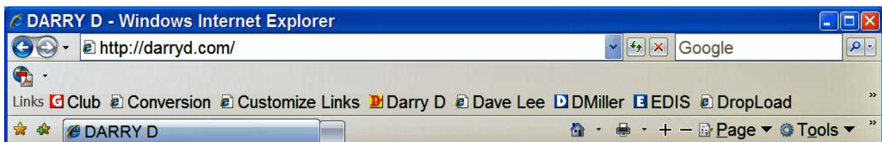
Figure 4 — Links Added

3. Using the steps in paragraph 1, I added the "Links" MenuBar. The result is shown in Figure 4.