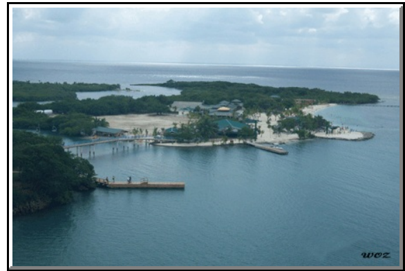
Mahogany Beach Dec/18/09

► MasterBaker, Jul/13/2010: Our reason for taking a tour in Roatan is simple. Snorkeling. Mahogany Beach is man made, although it is pretty it doesn't have a reef. I think it's great that Carnival has made that beach though. Many people don't like to venture out far from the pier area and Mahogany offers them a beautiful place to relax and enjoy a nice day ashore.