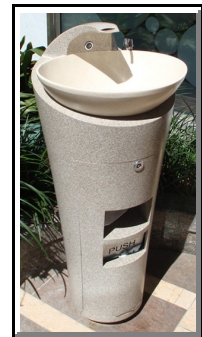
Hand Washing Station

➤ From Sun-Sentinel newspaper: http://tinyurl.com/cjer7a ➤ 'Radio', Mar 8, 2010: No photos are permitted during Hair Spray.